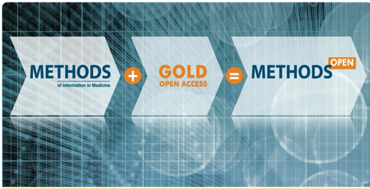
Fig. 3 Visualizing the transformation of Methods . The image was designed by Schattauer Publishers. When adding the Methods Open track to the journal's subscription-based track by implementing the Tandem Model in 2017, it was used to promote this new opportunity of Open Access publishing. Figure as presented in Haux et al. 18